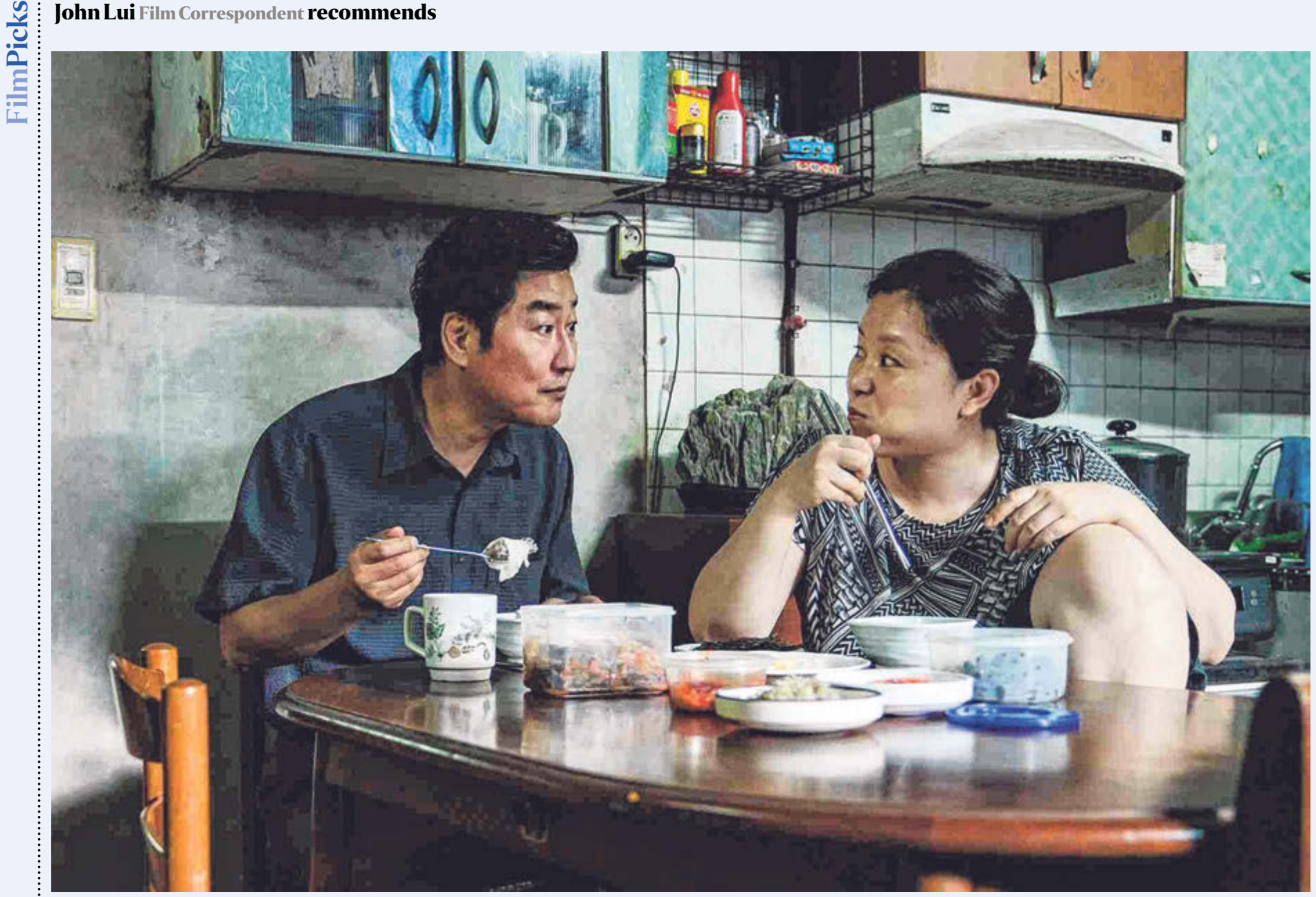
Song Kang-ho (left) and Jang Hye-jin star in Parasite.