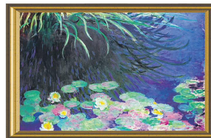
Painting by Monet