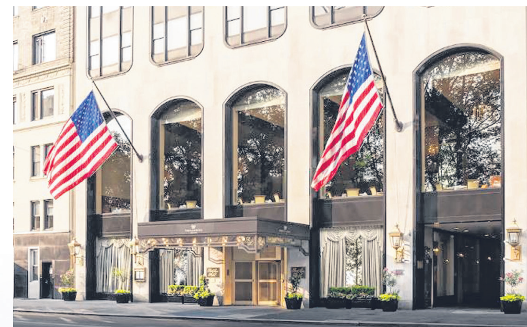
Park Lane Hotel in New York

• Private Bombardier jet, grounded in Singapore and valued at US$35 million • Superyacht, seized and sold by Malaysia, at US$126 million • Properties previously reported to be owned by him included three in New York – Park Lane Hotel (US$140 million), a Time Warner penthouse (US$31 million) and Green Park apartment (US$14 million) – an office and flat in London (US$98 million); and a Hollywood Hills mansion (US$39 million) in Los Angeles • A US$107 million stake in EMI Music • Myla lingerie company • He also had artworks by Picasso, Van Gogh and Monet