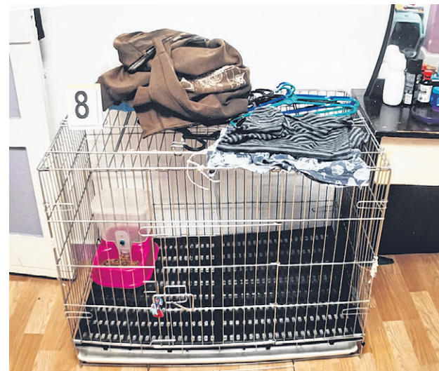
The cage in which the 1.05m-tall boy was squeezed into.