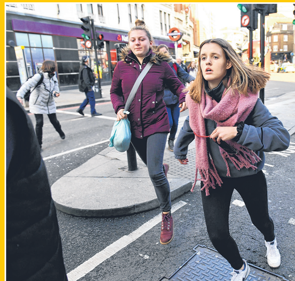
People being evacuated from London Bridge, near where the attack took place.