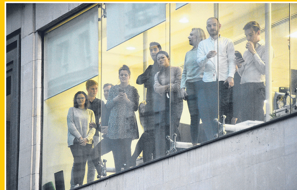
Office workers watching police near the scene of the attack on London Bridge in central London on Friday.