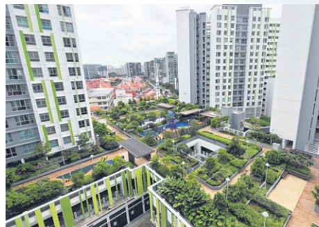
All residential blocks in Alkaff Vista are directly connected to a landscaped roof garden which forms a central community space for residents.