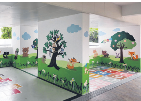
A small play area with games such as hopscotch next to the landscaped roof garden in Alkaff Vista.

The development will be linked to Bidadari Greenway, a cycling and pedestrian network, that runs alongside the new Bidadari Park Drive, one of three new roads in the estate. It has a multi-purpose pavilion and a large playground next to My World Preschool on the ground floor.