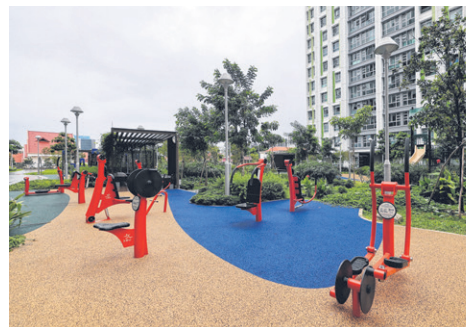
An outdoor fitness station surrounded by greenery on the ground floor in Alkaff Vista.