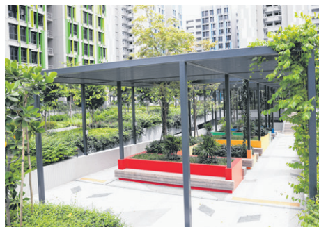
A landscaped roof deck, fitted with two playgrounds and a fitness station, sits on top of the three-storey carpark.