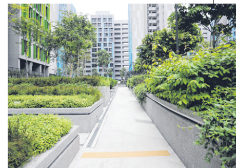
There are wide paths and ramps for wheelchair access in the garden to promote ageing in place.