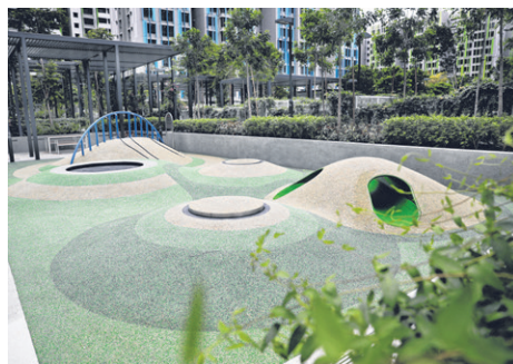
A children's playground, which includes a small slide and trampoline, in Alkaff Lakeview.

The heart of the development is a landscaped roof garden that overlooks the Alkaff Lake which, when completed, will have a conserved rain tree on a little island in the middle. A supermarket, coffee shop, childcare centre and shops are expected to open when more residents move in.