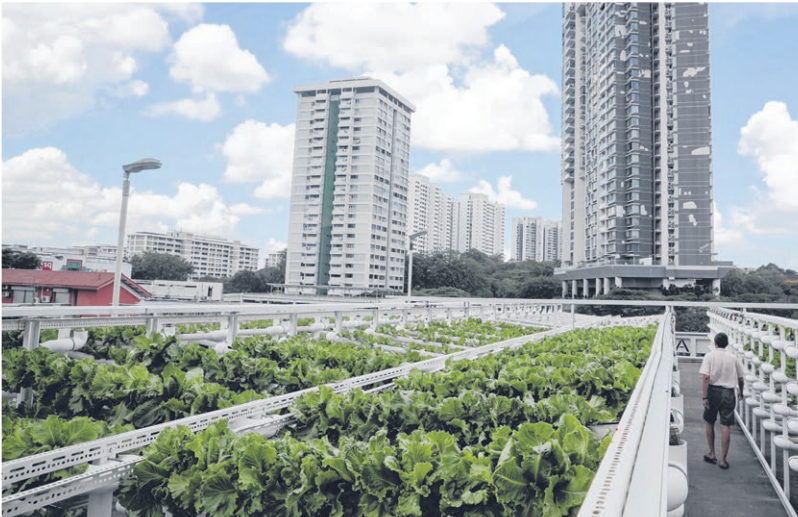
At the height of production, the 1,800 sq m Citiponics rooftop farm in Ang Mo Kio can grow up to four tonnes of vegetables each month.