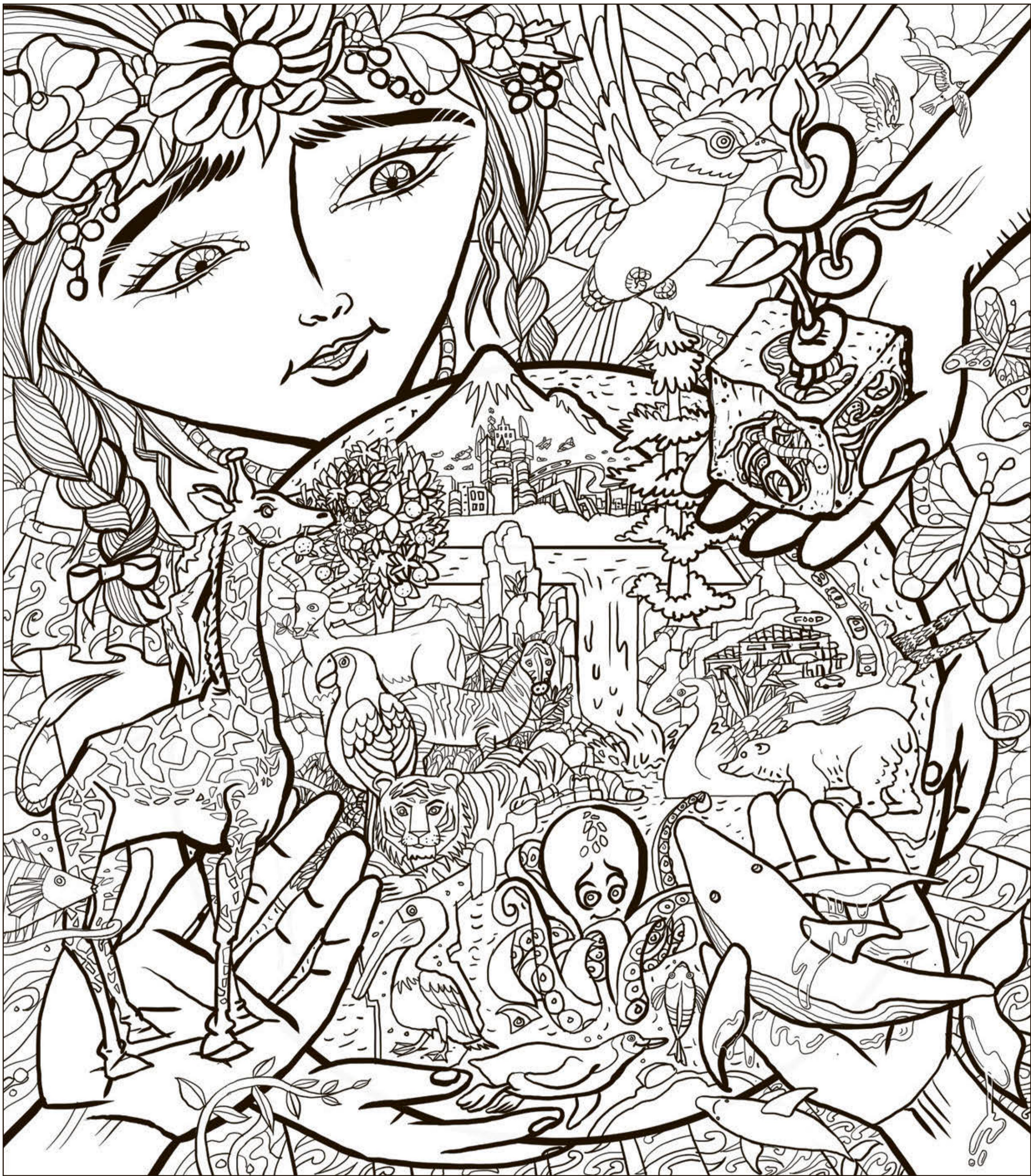
ST ILLUSTRATION: CEL GULAPA