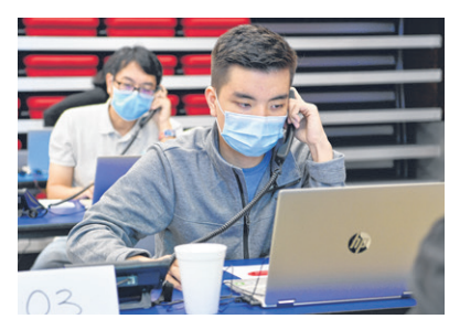
It also runs seven contact tracing centres to support the Health Ministry.