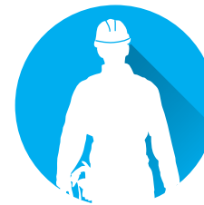
Not appointing a safe management officer