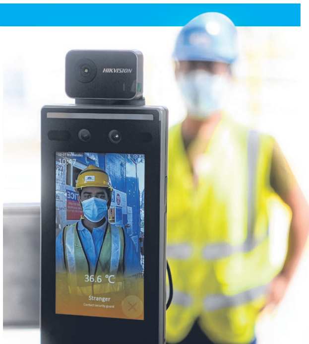
Use of the SafeEntry check-in system and temperature screening