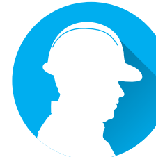
Workers without masks