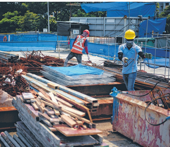
Segregating workers into separate teams and zones