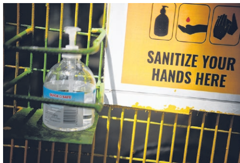
Providing hand sanitiser at accessible points