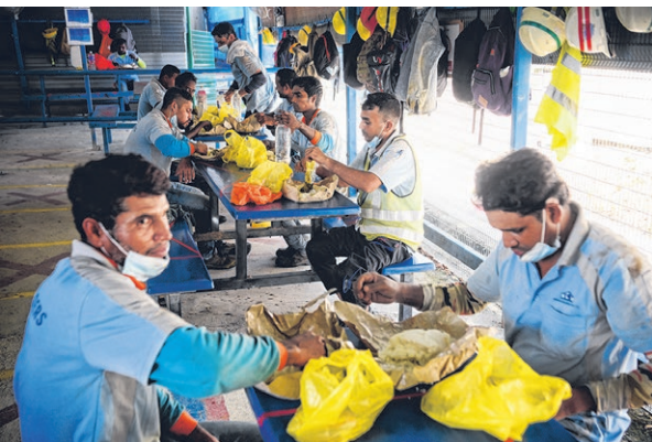
Provision of individually packed meals