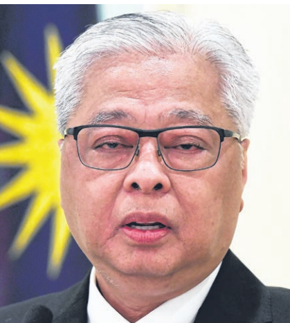
Ismail Sabri Yaakob