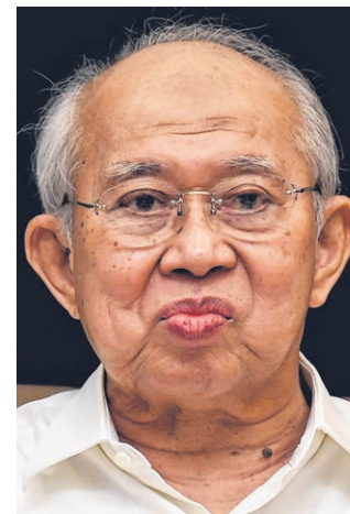
Tengku Razaleigh Hamzah