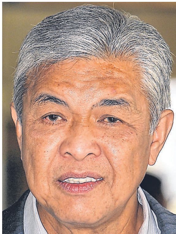
President Ahmad Zahid Hamidi