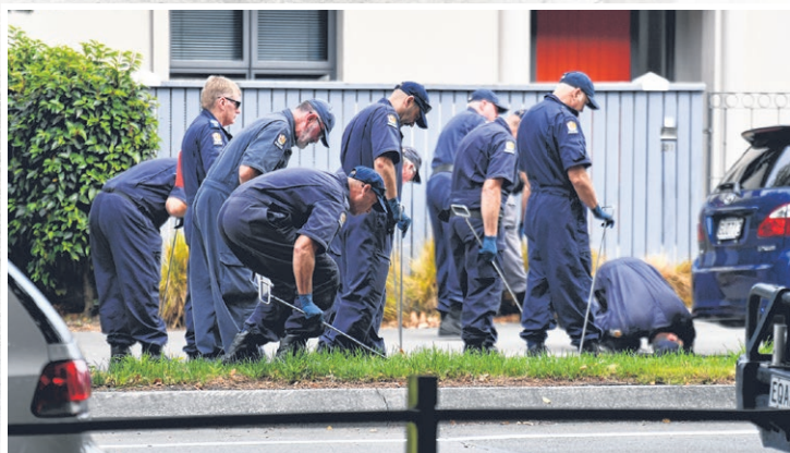
Police officers searching for evidence near the Al Noor mosque in Christchurch after the terror attacks in 2019.

surfing for violent materials and became angry after viewing a video showing the execution of Ethiopian Christians in Libya. • He erroneously concluded that Islam taught its followers to kill Christians.