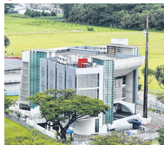
B Yusof Ishak Mosque in Woodlands