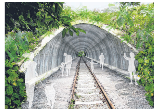
An old railway tunnel that lies under Clementi Road will be part of the trail.