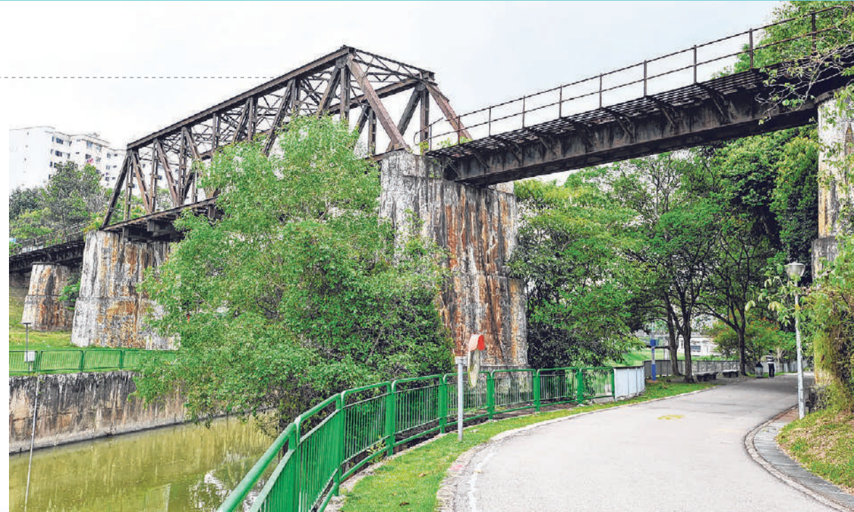
A railway bridge over Ulu Pandan Canal will feature in the Old Jurong Line Nature Trail.

Three new trails spanning 9km will be created in Clementi and Jurong, as part of a new nature corridor that will also facilitate wildlife passage between Bukit Timah Nature Reserve and the Southern Ridges. Two trails will run through Clementi Forest, a site that captured the attention of many when drone footage of the area spread on social media last year. Ng Keng Gene explores the new trails.