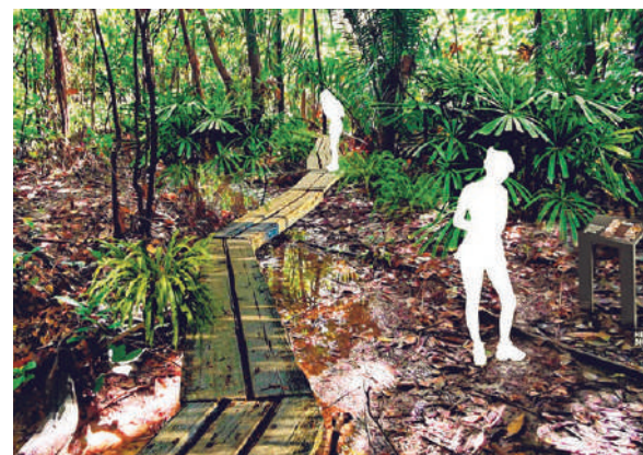
A trail within the upcoming nature park in the western half of Dover Forest.