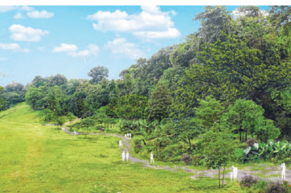
The Clementi Nature Trail will run along Bukit Timah First Diversion Canal.