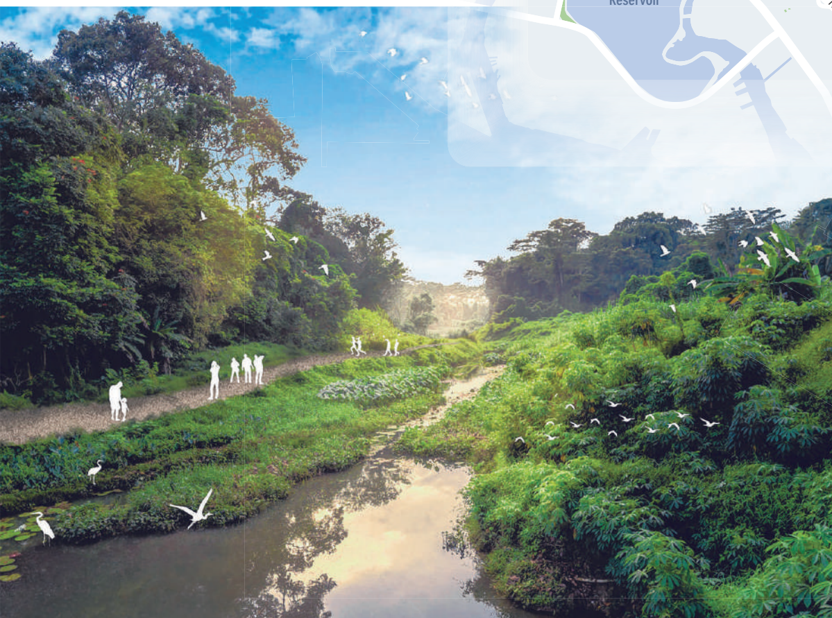
An artist's impression of an upcoming nature trail along the Clementi Forest stream.