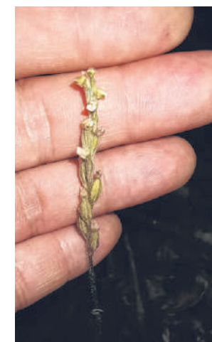
Two rare terrestrial orchids – the Dienia ophrydis (left) and Zeuxine clandestina (right) – were found in Clementi Forest. As more people have explored the area in recent months, the orchids' habitats are potentially at risk. The new nature trail will allow visitors to appreciate the forest's beauty while minimising their ecological impact on the area.